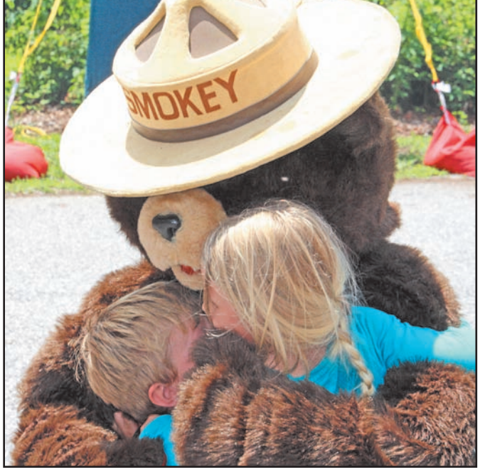
Smokey Bear loving on some local children.

It's a fact that volunteer firefighters couldn't do what they do without continued See Firefighters, Page 8A